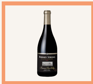
Rodney Strong Pinot Noir $56 Russian River Valley, California Soft & silky in texture, cherries, pomegranate & a nice lingering finish