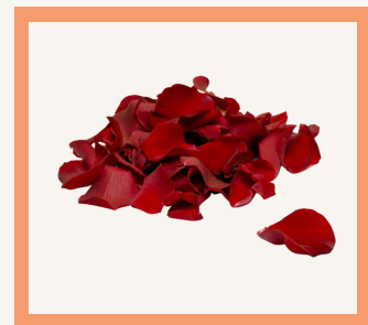
Rose Petals $55

All amenities are subject to added 17% gratuity and $5 delivery fee (excluding floral amenities)