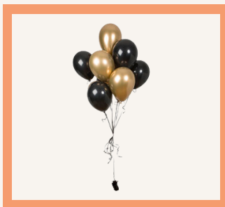
Balloon Arrangement $30 Specify theme & colors