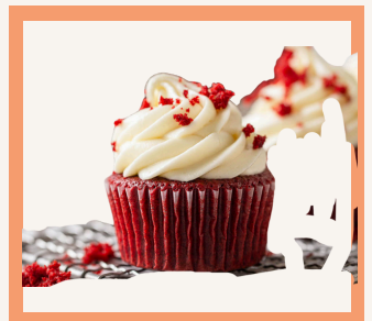
Red Velvet Cupcakes (6) $27