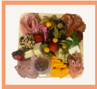
Gourmet Fruit, Cheese & Cracker Assortment $55 Without Fruit $45