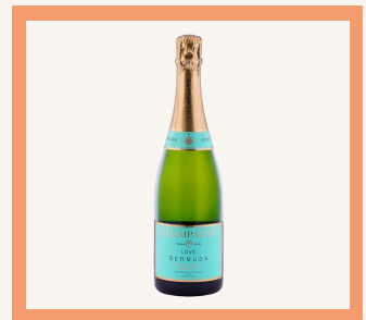
Love Bermuda Champagne $90 Fresh breadly aromas with notes of hazelnut, almond and cantaloupe melon, rich with flavours of honey and biscuity lees, fresh acidity