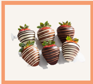
Chocolate Dipped Strawberries $29

Portions and pricing are based on a maximum of 2 guests. Surcharges apply for additional guests All amenities are subject to 17% gratuity and $5 delivery fee (excluding floral amenities) Minimum 24 hours advance time required but may vary for other items