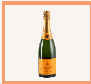
Veuve Clicquot Brut $122 Champagne, France Vibrant acidity framing hints of white cherry, biscuit, and honey