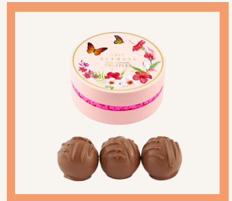
Love Bermuda Milk Chocolate Truffles (7) $29