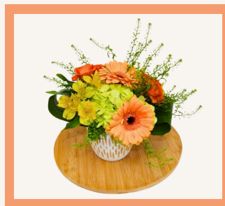
Radiant Delight $115.00 Flowers and vessel may vary