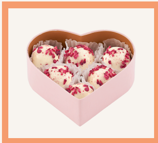
Love Bermuda White Raspberry & Champagne Truffles (6) $29