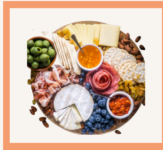
Charcuterie Board $60