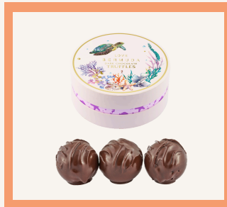
Love Bermuda Dark Chocolate Truffles (7) $29