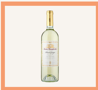
Santa Margherita Pinot Grigio $49 Trentino-Alto Adige, Italy A dry wine with flavors of green apple with a clean finish