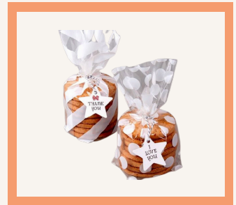
Assorted Cookies Paired with Bottled Water $20