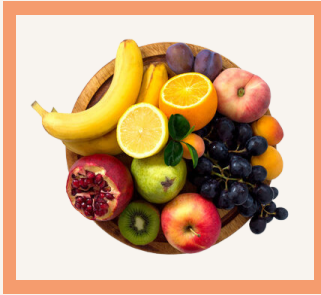
Seasonal Whole Tropical Fruits $30