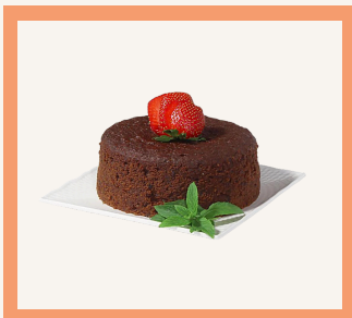
Traditional Bermuda Fruit & Rum Cake 5" $40