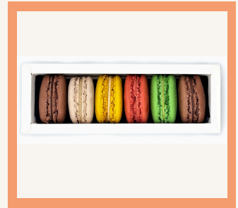
Assorted Macarons (6) $36